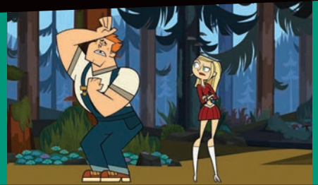
TWINNING ISNT EVERYTHING