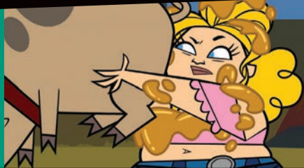
I LOVE YOU, GREASE PIG!