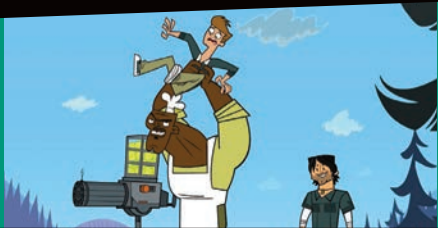
SO, UH, THIS IS MY TEAM?